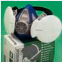
New Filter Technology: Particle, Gas and Combination Filters from the Advantage Range for the Advantage 200 LS

For storage and transport of the mask, the Advantage belt pouch provides a perfect solution.