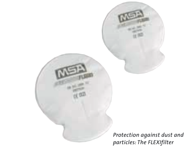
Protection against dust and particles: The FLEXifilter

The service life of respiratory filters depends on the ambient atmosphere, the user and the conditions of use. Gas filters must be replaced at the latest when