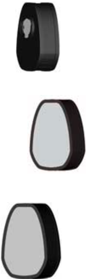
The new Tab Technology

odour, taste or irritation is detected. Gas filters against toxic or odourless gases must be replaced after a single use. The end of the service life of particle filters becomes apparent when breathing resistance increases.