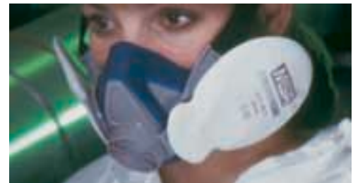
Advantage 200 LS with FLEXifilter

odour, taste or irritation is detected. Gas filters against toxic or odourless gases must be replaced after a single use. The end of the service life of particle filters becomes apparent when breathing resistance increases.