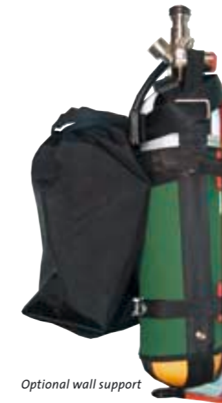
Optional wall support

The 3S is the most successful full face mask design in the world with over 5 million units sold. You can choose between standard or small size.