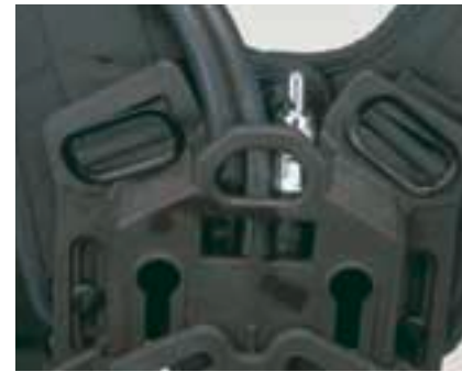
AirMaXX® S Retreat signal near the ear [For noisy applications]

MSA AirMaXX®, safety today and in the future!