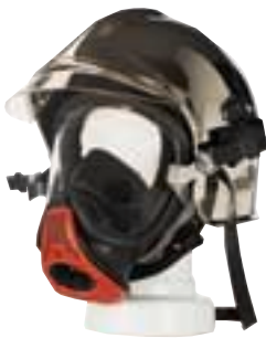
Ultra Elite H-PF-F1 [with MSA GALLET helmet]