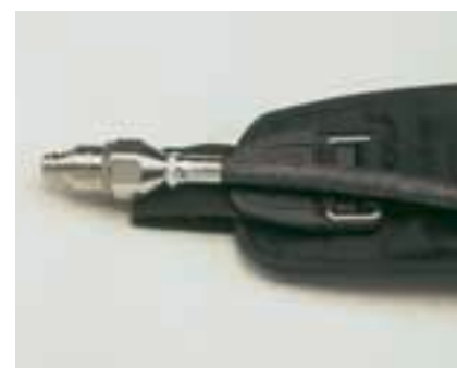
AirMaXX® Q The Quick-Fill connection permits charging the cylinders with the apparatus donned [Filling of air in 45 sec]