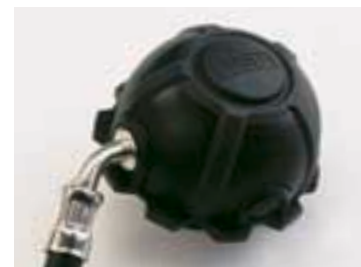
AutoMaXX®-N Normal pressure lung governed demand valve according to EN 148-1 [Cutting – edge tradition]

The large operating buttons are positioned where you expect them. The housing is designed that it cannot get caught and that blows are deflected. The protective cap assures highest operating safety: even in case of damage, the AutoMaXX continues to function.