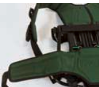
AirMaXX® harness Hip belt and shoulder pads assure pleasant wearing and optimal fit [Simply comfortable]

One for all: The MSA AirMaXX® has a carrying plate with triple length adjustment.