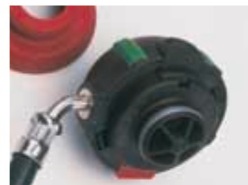
AutoMaXX®-AS Positive pressure lung governed demand valve with MSA plug connector [Fully automatic air supply]