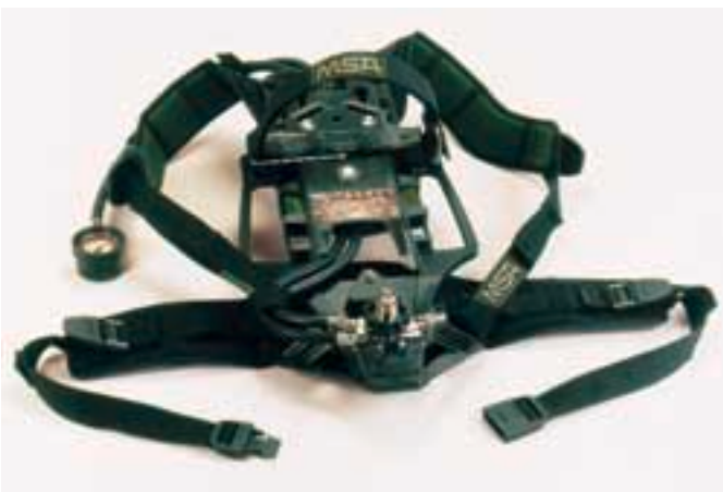
AirMaXX® basic apparatus [Comfort is standard]