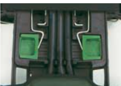
AirMaXX® carrying plate The triple length adjustment assures comfortable wearing [Utmost flexibility]