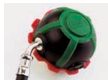
AutoMaXX®-AE Standard high pressure connector with M 45 x 3 thread according to EN 148-3 [Updated classic]

Maximum freedom of movement since the connections to facepiece and medium pressure line swivel. The silicone line remains flexible also at lowest temperatures. The semiglobe shaped housing is handy and the coloured operating buttons can be pushed easily also with gloves. The lung governed demand valve is easily activated with the first breath and operates very quietly. A lung governed demand valve of the luxury class!