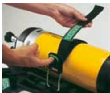
AirMaXX® cylinder retainer Exceptionally simple and quick cylinder change [Simply quick]

Changing the cylinders is no problem: patented slide studs make changing simple and easy. On closing the cylinder strap buckle, the slide studs are pressed down and the cylinder is secured absolutely safe in position. With the handy bracket the length of the strap is quickly extended. Thus, cylinders of different size are quickly exchanged!