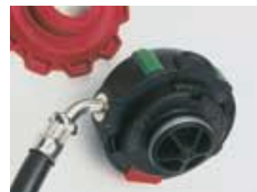
AutoMaXX®-AS-C: Combines the standard M 45 x 3 thread with the handy plug connector [Crossing generations]